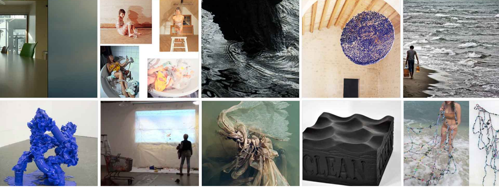
Image above: Detail of the Top 100 creative submissions to The Universal Sea Open Call running from October - December 2017.